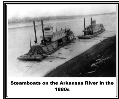
Steamboats on the Arkansas River in the 1880s