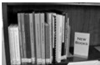
Four new genealogy books added to the Lakes Region Library.